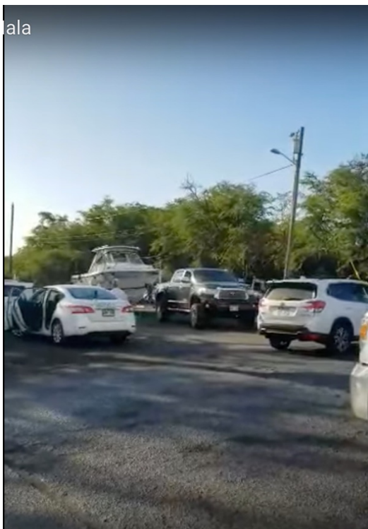
Figure 1 Congestion to access ramp (from video 1)

The community, however, has been pushed out of Mala. Commercial operations monopolize trailer and car parking, the ramp, and even park in the area for boat washing. As evidenced in the video linked below (Video 1 at https://youtu.be/zxuFcWZHCEQ ), the area is so congested at times that trailered boats can barely make it to the ramp. Customers of tour operators crowd the ramp, creating a dangerous situation for those trying to load and unload their boats. Competition for boats to enter and exit the water is high.