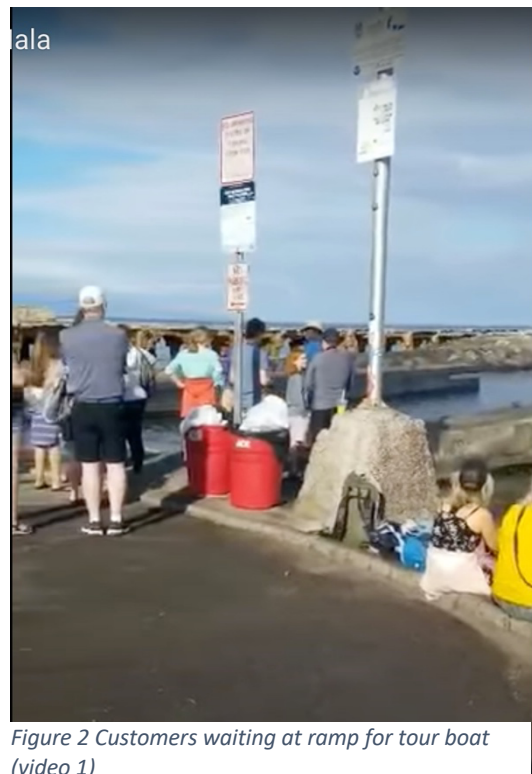
Figure 2 Customers waiting at ramp for tour boat (video 1)